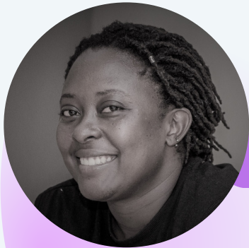
RUBY Executive Director