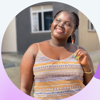
BERBIE Programs Director